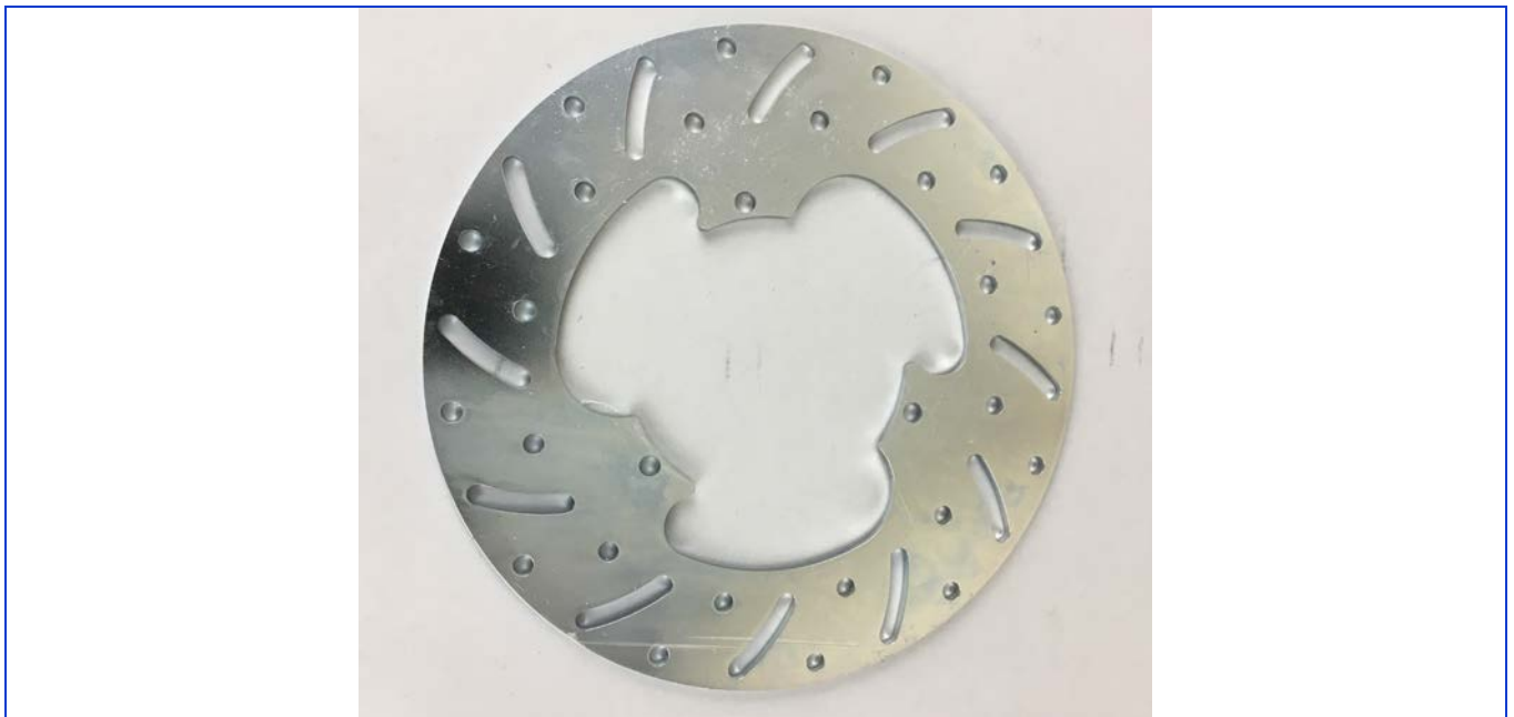
Photograph of brake disc