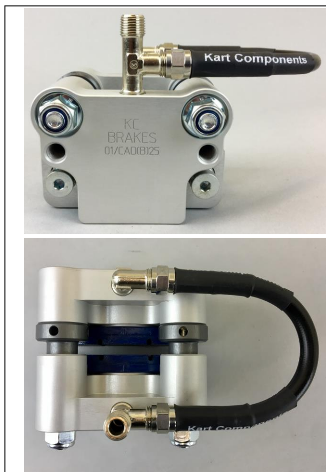
Photograph of brake calliper