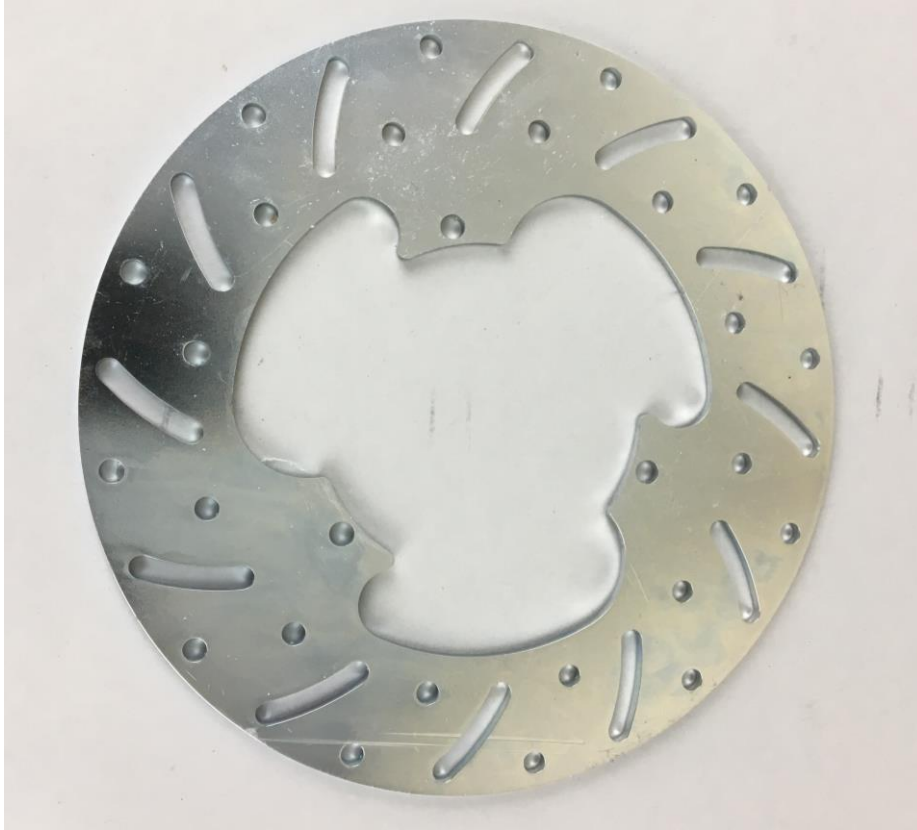
Photograph of brake disc