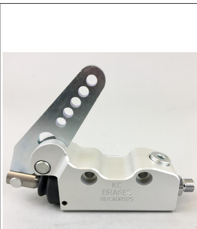
Photograph of master cylinder